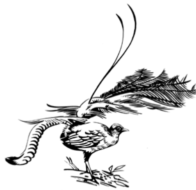
Superb Lyrebird

Badger Weir Picnic Area is the perfect place to enjoy a picnic or barbecue. Visitors can enjoy fresh mountain air and forest walks passing through ancient fern gullies, across clear mountain streams and meandering amongst mighty Mountain Ash.